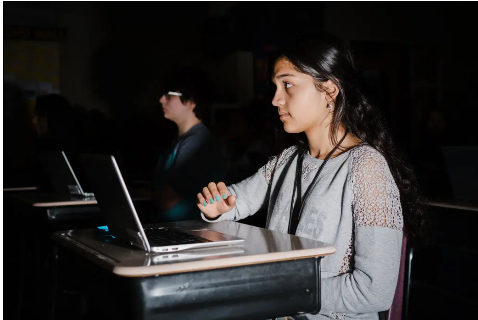
Chicago Public Schools, the third-largest school district in the country, decided in 2012 to adopt Google's platform.

In doing so, Google is helping to drive a philosophical change in public education — prioritizing training children in skills like teamwork and problem-solving while de-emphasizing the teaching of traditional academic knowledge, like math formulas. It puts Google, and the tech economy, at the center of one of the great debates that has raged in American education for more than a century: whether the purpose of public schools is to turn out knowledgeable citizens or skilled workers.